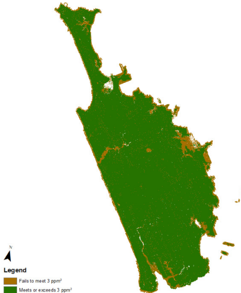
Density Mosaic for Northland Region